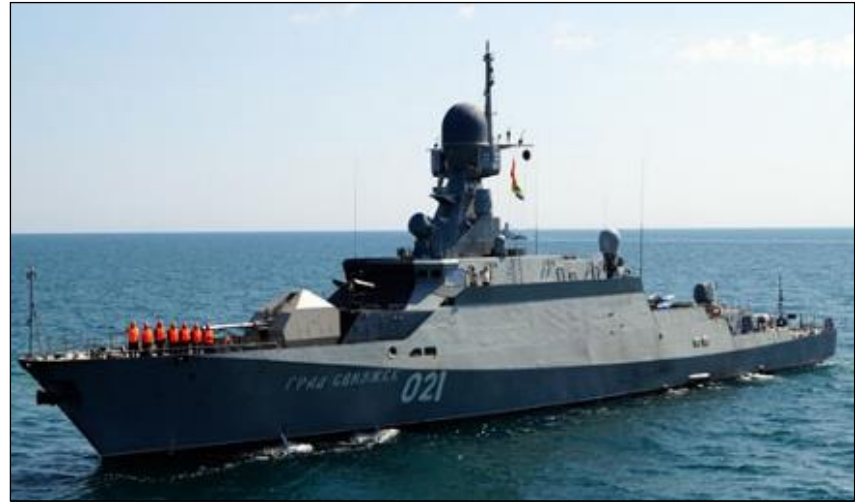
21631 project corvette