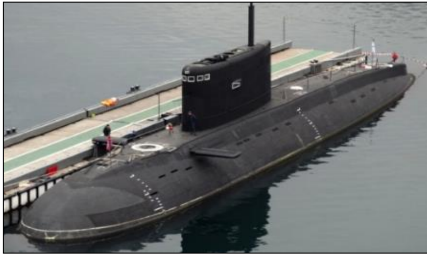
636.3 project submarine