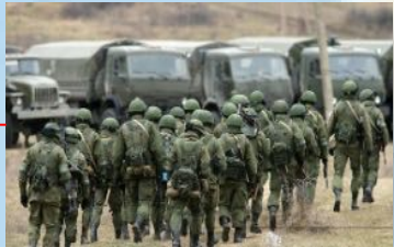
Numerous combat training activities

Increasing mineralization of artesian water