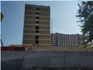
Construction of cantonment for the National Guard of Russia (Sevastopol)