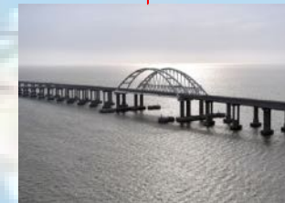
Bridge across the Kerch Strait